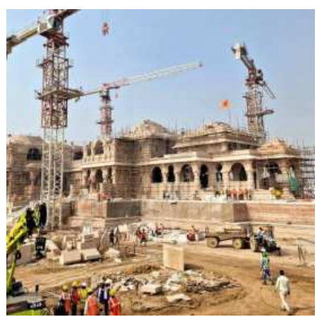
Changing landscape: Before the Supreme Court verdict made way for the temple's construction, land prices in area used to be 15-20% of what it is now, say realtors.

Before the Supreme Court's November 2019 judgment cleared the way for the